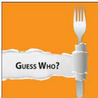
Guess Who's Coming to Dinner? 2nd Annual event March 17th Host Family homes

"See! The winter is past; the rains are over and gone. Flowers appear on the earth; the season of singing has come." Song of Solomon 2:11,12 NIV